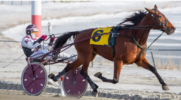
CLASS ME NICE

Racetracks are required to notify the AGCO of the official weather source they will be using to determine the forecasted temperature. This source is posted at the racetracks and is also available on the AGCO website, in “Know Your Obligations” section at the bottom of the Operators: Racetracks and Teletheatres webpage .