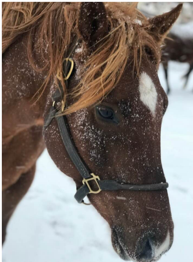
ICE CREAM SOCIAL © 2018 Bernard McCormack