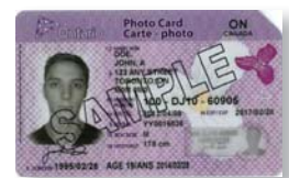
Front Face with Age Banner