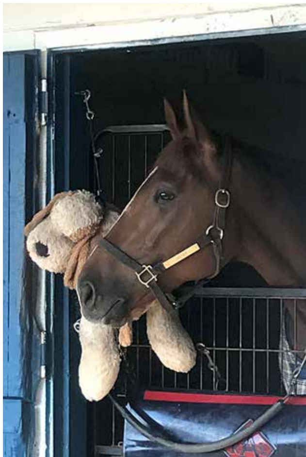
UNITED (Giant's Causeway - Indy Punch)