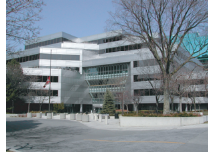
90 Sheppard Avenue East, Suite 200 Toronto ON M2N 0A4 416-326-8700 / 1-800-522-2876