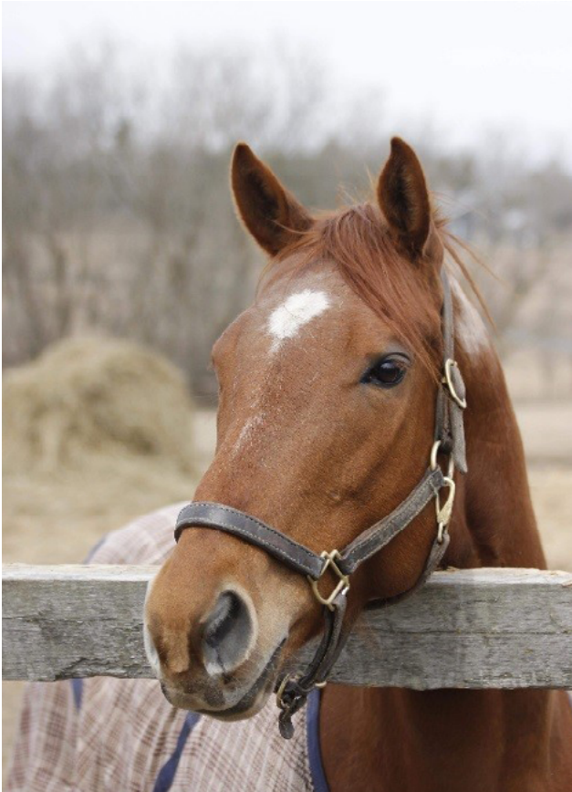
SHESASTREAKIN CHICK